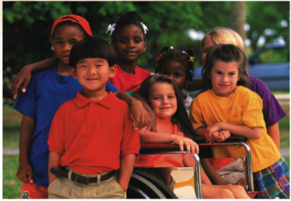
Variety of the United States Annual Report 2005